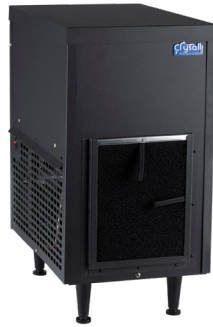
CR-UCM2 CR-UCM2-SW-2 CR-UCM2-2CL